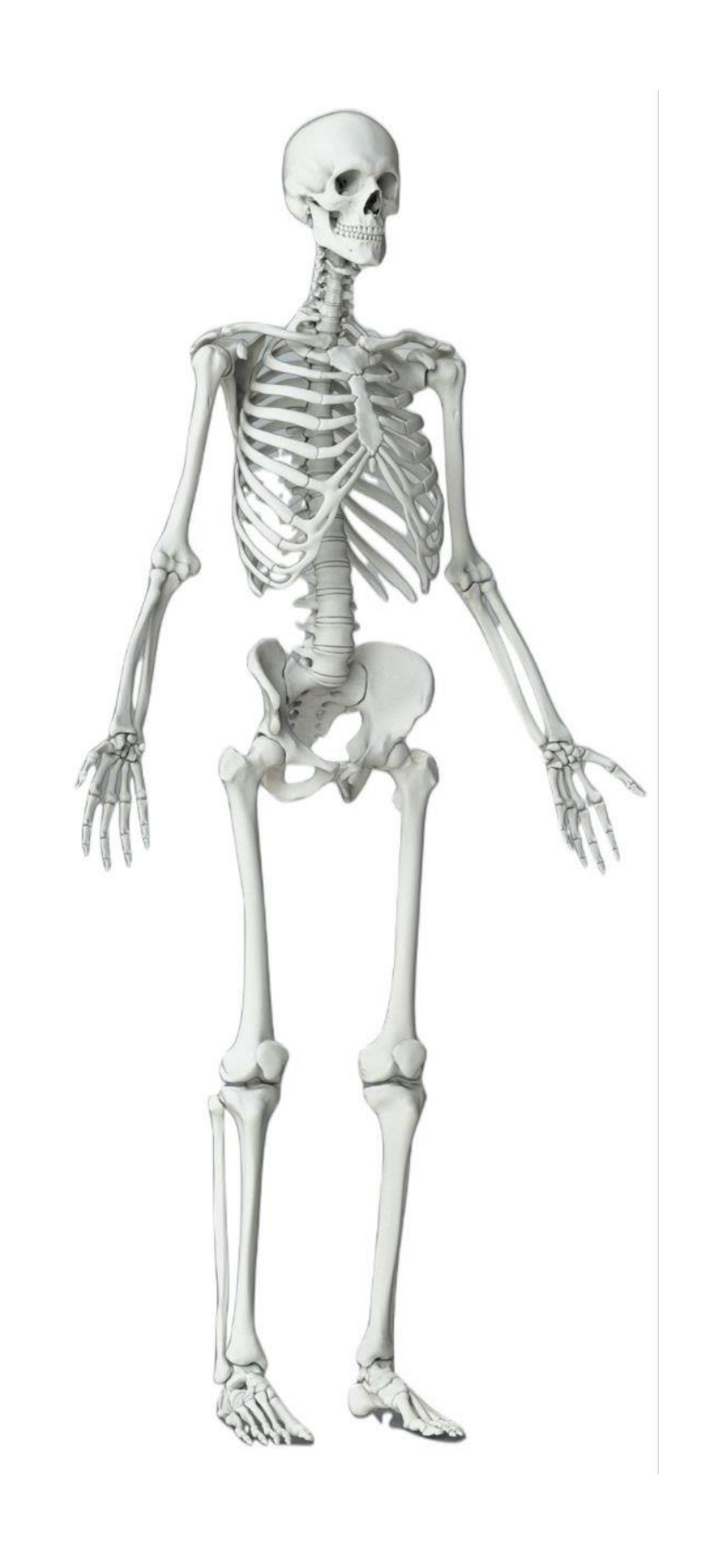
am. Mushtaq Abbas Jassim